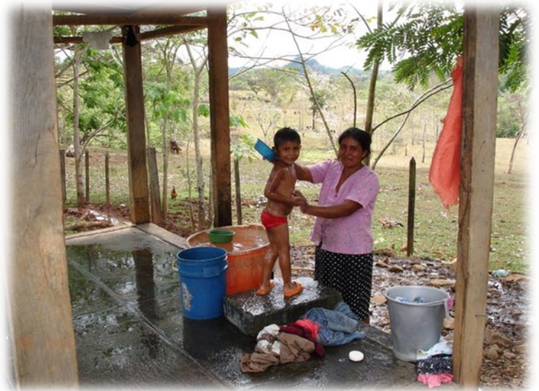
The blessings of safe water—priceless!!!

We and, especially, the villagers would be most appreciative if you would join us in funding these safe water projects. 100% of your contribution will be applied to one of them. You will receive periodic updates regarding progress and be advised of the project's completion and final results.