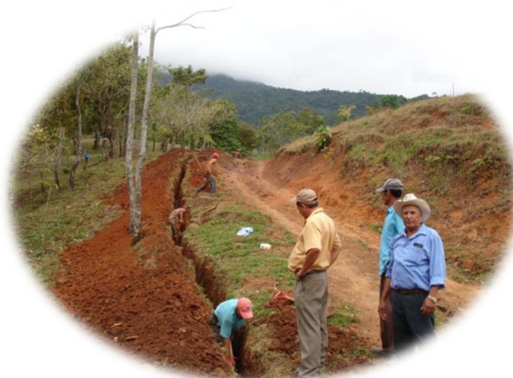
La Isla 3 trenching for pipeline from spring to tank

It is a very robust structure. There are 4 terraces of reinforced concrete leading to the transfer box and pipeline to the storage tanks. And there were 8500 linear feet of piping going from spring to the storage tanks just outside of village that were installed manually, 1 meter deep. It will take a mighty earthquake to dislodge this encapsulation and unearth the pipeline!