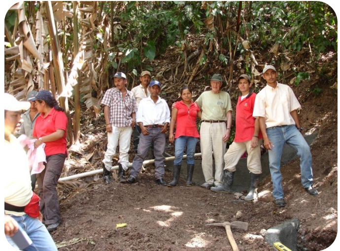
El Carrizal villagers working on spring encapsulation

Year in & year out, when villagers, like the people of El Carrizal, make the decision to invest themselves in building a safe water system as well as constructing latrines for hygienic sanitation, it represents a triumph of hope and trust over skepticism and fear. Now that the project is complete their lives are transformed. Their health has improved immediately. And they understand, as never before, that it is as a community that they have the best chance to improve their lives.