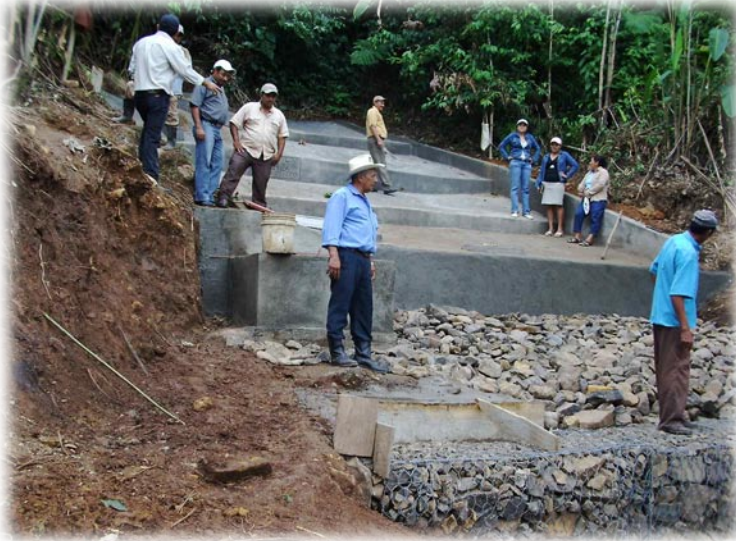
La Isla 3 terraced spring encapsulation in progress

We go way back with La Isla. They were a hamlet of 150 in 2000 when we funded their first gravity flow water project. RWV next funded La Isla 2 in 2005 to provide safe water and sanitation for the people who were moved to the outskirts of the village by the Nicaraguan government following destruction of their homes by horrific mudslides in 2004.